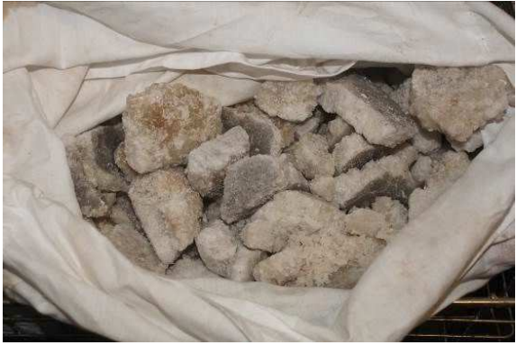
Calculation yield: approx. 1 300 000 MDMA tablets (120 mg concentration, average)