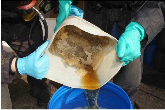
160 kg of MDMA were seized.

sites in Stevensbeek and Hoornsterzwaag. Illicit laboratories were linked via similar equipment, chemicals and final products seized. The synthesis and crystallisation processes were identified on the two sites. Large-scale manufacture of MDMA and mephedrone was confirmed. In total 160 kg of MDMA and 26 kg of mephedrone crystals were seized.