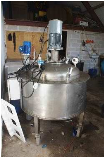
Similar equipment was seized in two locations, which was used for the illicit synthesis of mephedrone. As final product, 26 kg of mephedrone crystals were seized.

These combination sites (where two different products were being manufactured) clearly indicate that OCGs are not just limited to illicit sites where manufacture of traditional synthetic drugs takes place. They use opportunities and market demand to generate more profits.