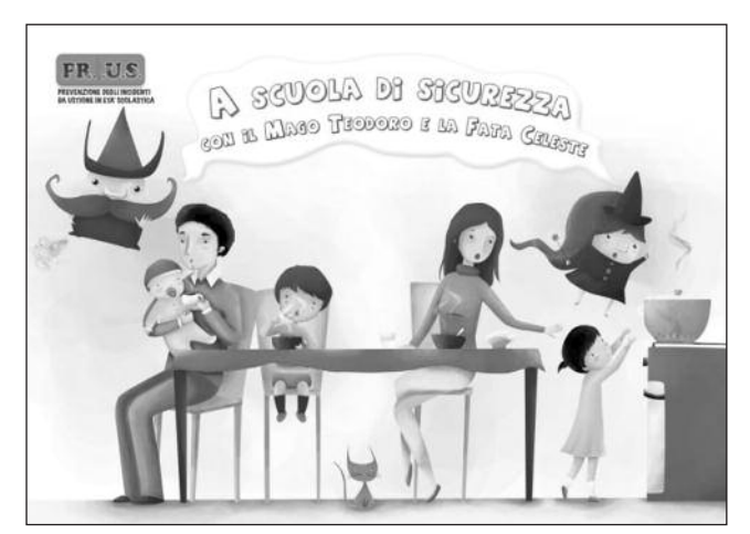
Fig. 1 - Comic book cover - PRIUS Project.

vided into four main home environments: kitchen, bathroom, living room and outdoors. For each indoor environment there is a presentation page, four tables with regular comic panels and a final full page, in addition to a summary of the hazards relating to that environment. Only the external environment is represented entirely by a single table. Each page of comic strips includes a black and white panel, allowing a degree of interactivity, as children can color the pictures themselves, thus providing entertainment as well as training. The comic book images were colored using digital painting techniques, giving a more current effect to a classic product. The choice of colors were obviously bright, helping to provoke an immediate interpretation, softened with delicate shading designed to create a pleasant experience.