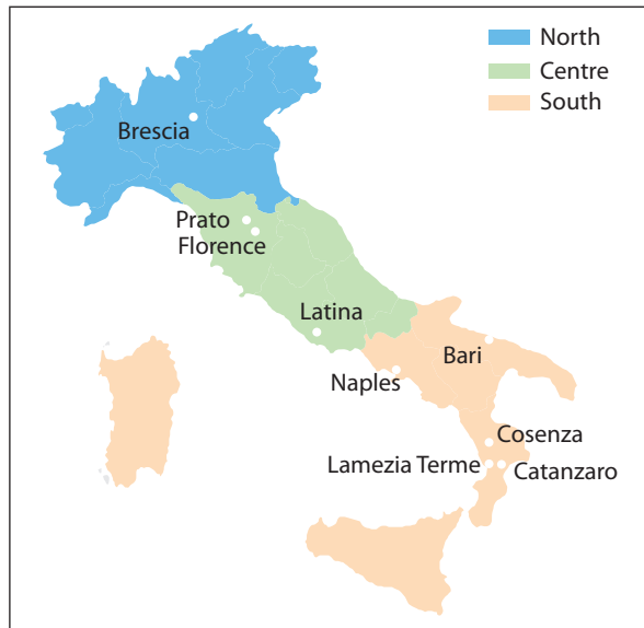
Figure 1 Cities where participating clinical centers were located.

tests, plasma HIV viral load), clinical parameters (AIDS clinical stage according to WHO criteria, current and previous antiretroviral therapy, opportunistic infections), immunological data (lymphocytes counts [absolute and percent], CD4+ T cell counts [absolute and percent], CD8+ T cell counts [absolute and percent], CD4/CD8 ratio) and information on co-infections (hepatitis B and C, tuberculosis). Information reported in the crf was required to be referred to the draw blood