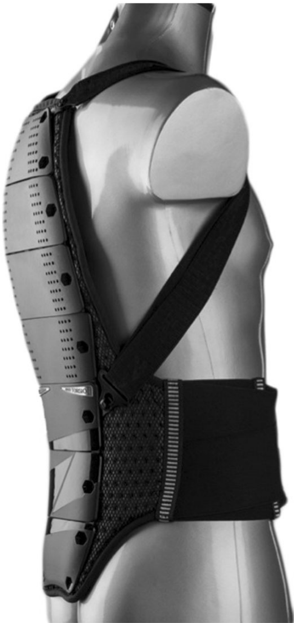
Figure 2. Hard-Shell Back Protector Device for the whole spinal column (cervical, thoracic, lumbar and sacral sections) worn on manikin. EN1621-2/12 Standard; CE2 certification.

BPD. Data analysis was carried out using Stata/SE 12.1 (StataCorp, College Station, TX, USA).