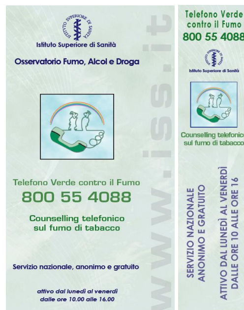
Figure 1. Leaflets and bookmarks of the Italian Antismoking Helpline.

These campaigns were based on several concepts of social marketing; one such concept is the primary and secondary audiences [38]. In these campaigns, tobacco users who can be encouraged to call helplines are the primary audience, but there are important secondary audiences as well [38], such as tobacco users who may not call the helpline, but who will nonetheless make an attempt to quit as a result of the campaign. Friends and family members of tobacco users, local tobacco control advocates,