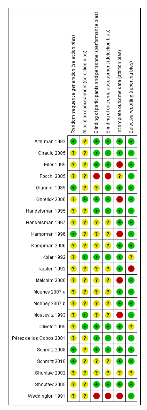
Figure 2. Risk of bias summary: review authors' judgements about each risk of bias item for each included study.