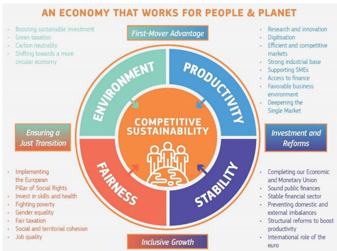
Figure 1: four broader strategic objectives of the European Semester (4-pillars)

This year Annual Sustainable Growth Strategy (ASGS) has kicked off the European Semester 2021, highlighting the difficult challenges the EU will have to face in the years to come. Although the size of the impact of the COVID-19 pandemic is still unclear, there are no doubts that the EU and its Member States need to be ready to face its socioeconomic consequences to avoid a spiral of negative trends across the EU, which would ultimately lead to an increase in inequalities and related health inequalities.